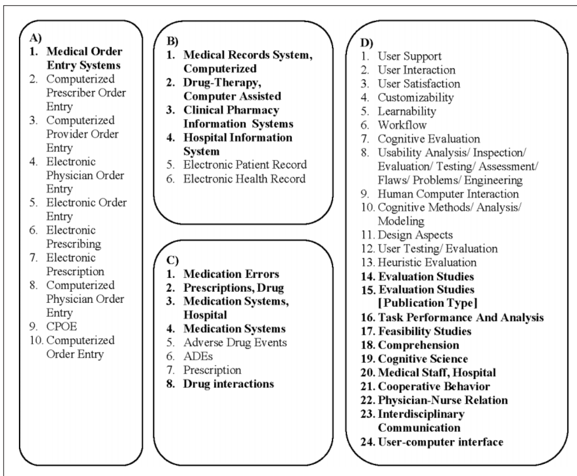
Fig. 1 Groups of keywords and MeSH terms used in the search strategy (MeSH terms are in bold)

We searched the literature from 1986 to 2007 using PubMed, EMBASE and Ovid