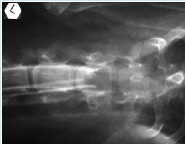
Fig. 2 Ventro-dorsal myelogram revealed pooling of the contrast agent at C6 with a 'golf tee' pattern on the left side of the spinal cord at C6.