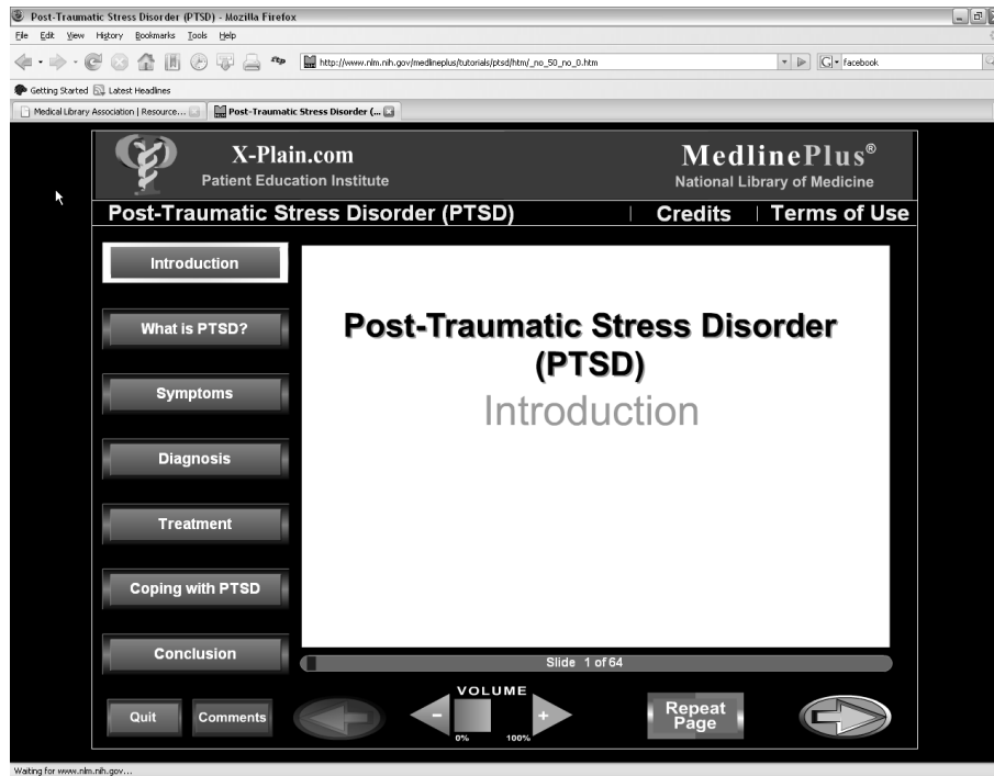
Fig. 1 An interactive web tutorial from the MedlinePlus Web page showing the multimedia capacities of modern web pages and the value that can add to enter information and develop more interactive web-based applications.

limiting such networks to clinicians but expanded to include all stakeholders in the health field for sharing their particular knowledge. One of the goals mentioned in the article is the free sharing of knowledge including knowledge stored in scientific articles to be made available. This can also limit the need for expensive knowledge repositories such as UpToDate 17 , where selected authors provide regularly updated overview articles for many topics.