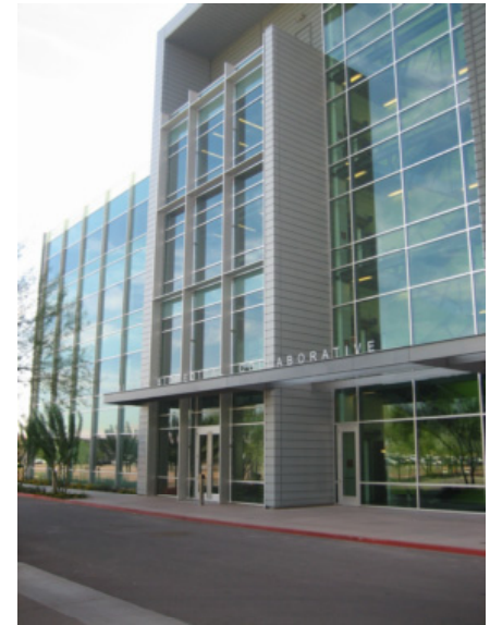
Fig. 1 The new Arizona Biomedical Collaborative-1 building on the Phoenix Biomedical Campus, housing the Arizona State University Department of Biomedical Informatics on the first two floors. The upper two floors are occupied by the Department of Biomedical Sciences of the University of Arizona College of Medicine-Phoenix in Partnership with Arizona State University (COM-PHX).

As mentioned, the PBC also is home to the Translational Genomics Research Institute. (TGen), a non-profit organi-